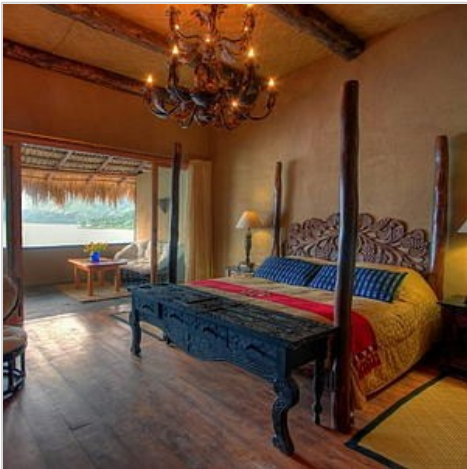
At Laguna Lodge, being eco-friendly does not mean sacrificing luxury or design.